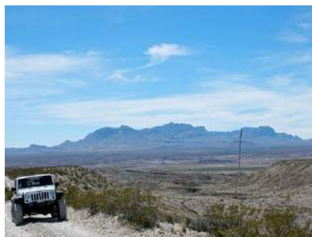
North of Black Peaks