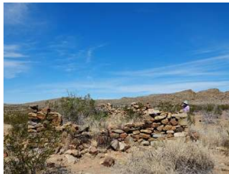
McKinney Ranch house

Continue north along a small set of badlands containing two small pyramid shaped hills called Black Peaks. End the trip on pavement south of the north entrance station.