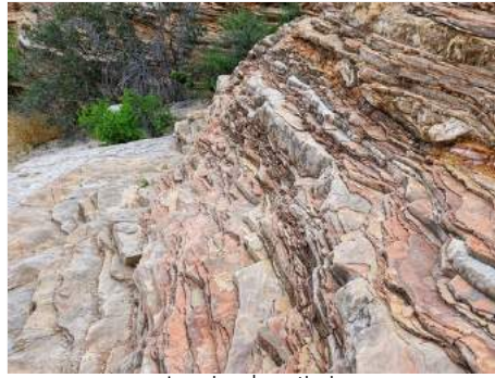
Layering above tinaja

Two miles north is another series of tinajas, the largest of which is called Tinaja Carlota. Park beside the road and walk a very short trail down the hill to overlook them.