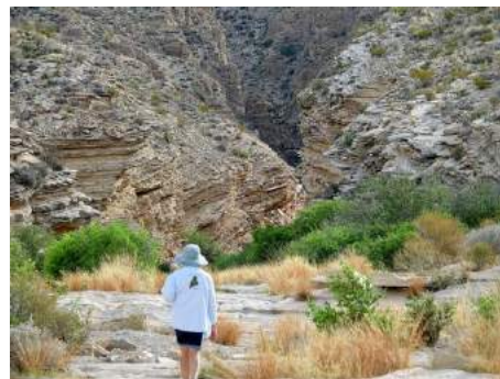
Walking toward Ernst Tinaja

The tinaja holds water year around. Deer, javelina, a mountain lion and other animals have been found drowned in the tinaja when they could not climb out after drinking.