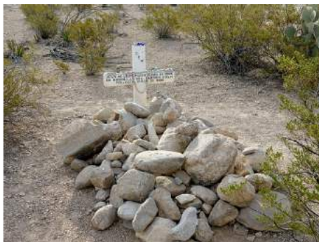
Juan de Leon grave

Drive to the end of a side road and park at the turnaround. It is an easy half mile hike to Ernst Tinaja, a deeply eroded pocket in the canyon bottom. Tinaja translates as "large earthen jar".